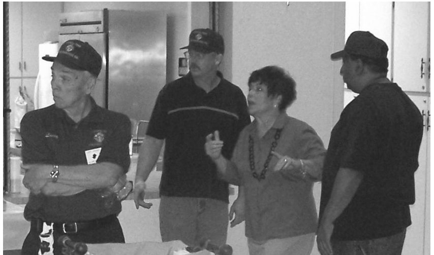
St Stephen Baccalaureate Breakfast. A number of Knights helped serve food and clean-up afterwards.